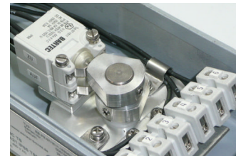
Bartec limit switches